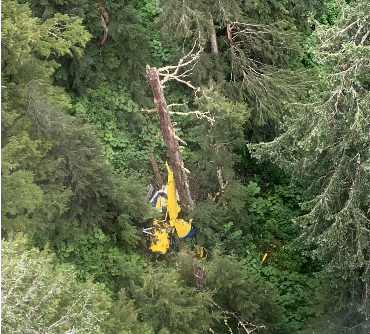
Figure 2. Aerial view of airplane at the accident site.

The fuselage came to rest on the left side and was impact crushed. The right wing remained attached to the fuselage. The outboard section of the right wing was impact separated but remained attached through a cable. The empennage remained attached to the fuselage and was impact damaged. The rudder and vertical stabilizer remained attached to the empennage, but the vertical stabilizer tip was separated. The left horizontal stabilizer and elevator were impact separated. The right horizontal stabilizer remained attached to the empennage and exhibited leading edge damage. The right elevator was impact separated. The floats were impact separated. The forward section of the left float was impact damaged. Flight control continuity was confirmed from the flight controls in the cockpit to all flight control surfaces.