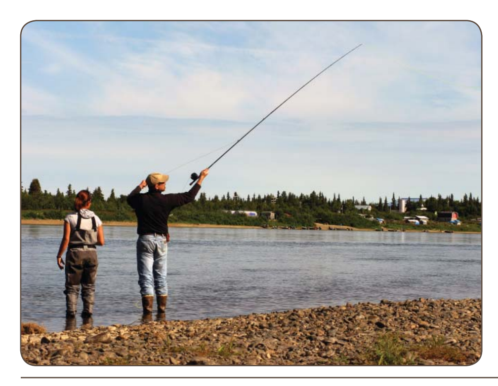
Goal 5: Alaskans are engaged in our food system.

Objective 5c: Increase the opportunities for advocates of healthy food initiatives and educators about healthy food to be heard by policy makers and the public.