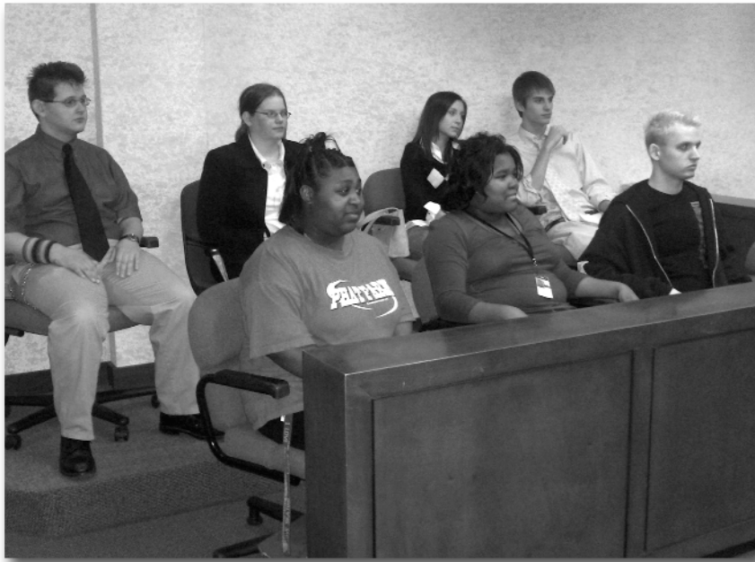
Jurors from the Jefferson County Teen Court (KY).