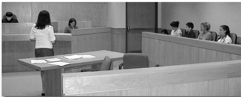
Proceedings in the Colonie Youth Court Program (NY).