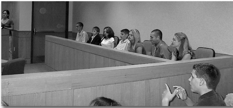
Jurors in the Colonie Youth Court Program (NY).